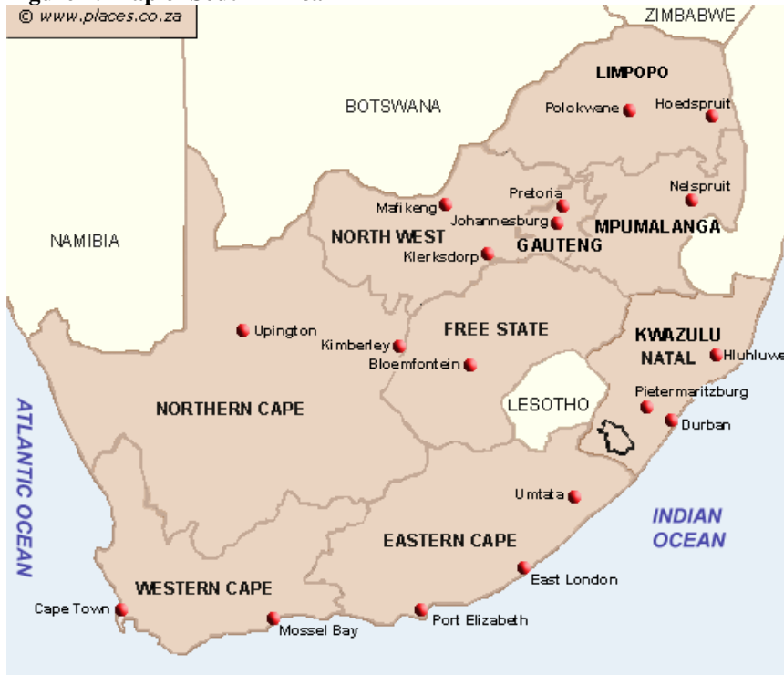
Figure 1: Map of South Africa

The PoA is located within the geographical boundaries of South Africa.